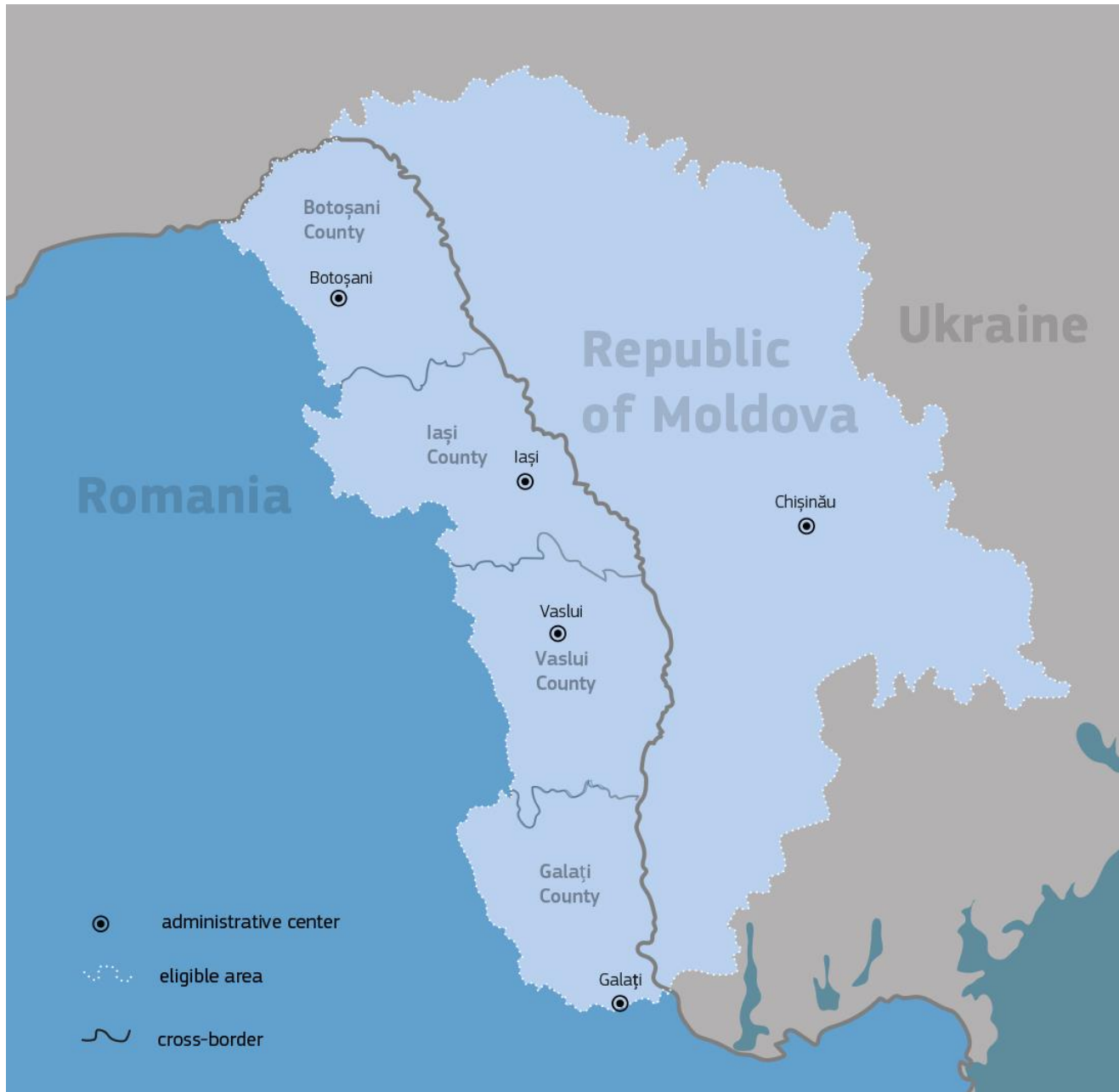
Map of the programme area